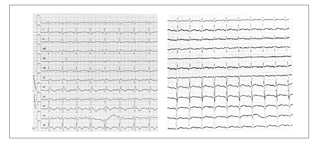
Figure 3. Left: ECG recorded the day after admission; a sinus rhythm 75 bpm, with a 1<sup>st</sup> degree atrio-ventricular block (PR interval 250 ms) and a QRS with a right bundle branch block is observed. Right: The ECG, recorded 3 days after admission, shows a normal sinus rhythm with normal atrio-ventricular and intra-ventricular conduction.

Forty-two days after discharge, the patient was readmitted because of recurrence of syncope, that, again, occurred while she was at school and was associated with an ICD discharge. On admission the patient was conscious, asymptom-