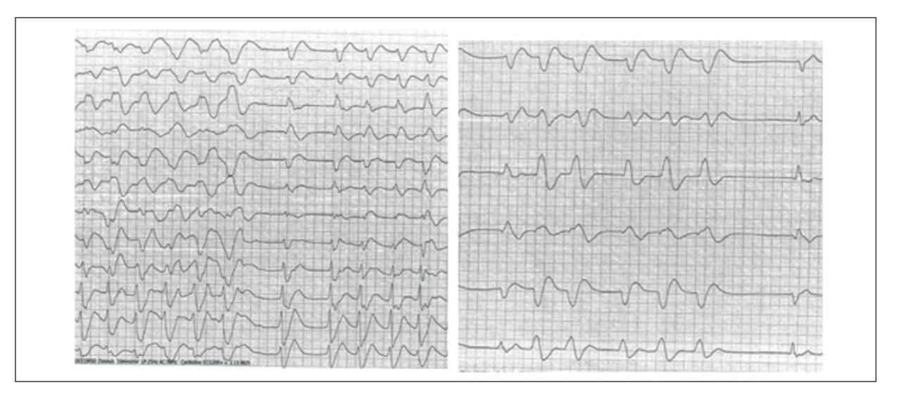
Figure 4. Left: The first ECG on the second admission shows a wide QRS (160 ms) rhythm similar to that of the first admission, but with a lower heart rate (84 bpm) and some short pauses (initial RR interval 1,320 ms). Right: Peripheral leads recorded some minutes later; a slowing down of the wide QRS rhythm, which appears irregular and with narrowing of QRS complexes after pauses, is observed.

atic and in stable hemodynamic conditions. BP was 120/80 mmHg and peripheral oxygen saturation 100%. Routine haemato-chemical exams, including electrolyte levels, were also normal. The admission ECG, however, showed the same type of wide QRS rhythm of the first episode, but with HR varying from 82 to 110 bpm and variable widening of QRS complexes (Figure 4, left). Subsequent ECGs showed increasing phases of bradycardia with irregular and polymorphic rhythms (Figure 4, right), with sporadic short phase of sinus P waves with an RBBB+RAD conduction.