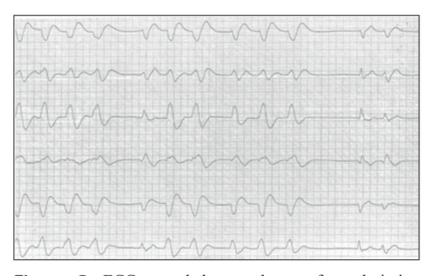
Figure 2. ECG recorded some hours after admission (peripheral leads). The ECG shows short phases of a wide QRS rhythm with right axis deviation (rate 75-85 bpm; QRS duration 200-240 ms), with small pauses (max 2.0 s) followed by tighter QRS complexes.

2 days later showed a normal sinus rhythm, with normal AV and intraventricular conduction, which remained stable throughout the remaining period of hospitalization (Figure 3, right).