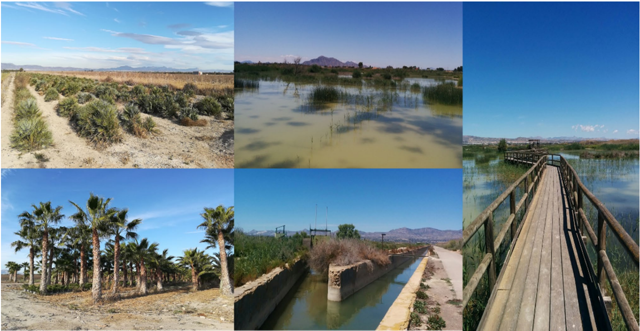
Fig. 2 Main water uses in El Hondo Natural Park: environmental, agricultural and recreational

conflict resolution (Godden and Ison 2019) because stakeholders' engagement incorporates a distinctly constructivist stance, focusing upon the meanings and values that individuals and communities attach to their physical surroundings and potential environmental harms, and the tactics and discourses mobilized to engage those meanings and values (Fisher et al. 2020).