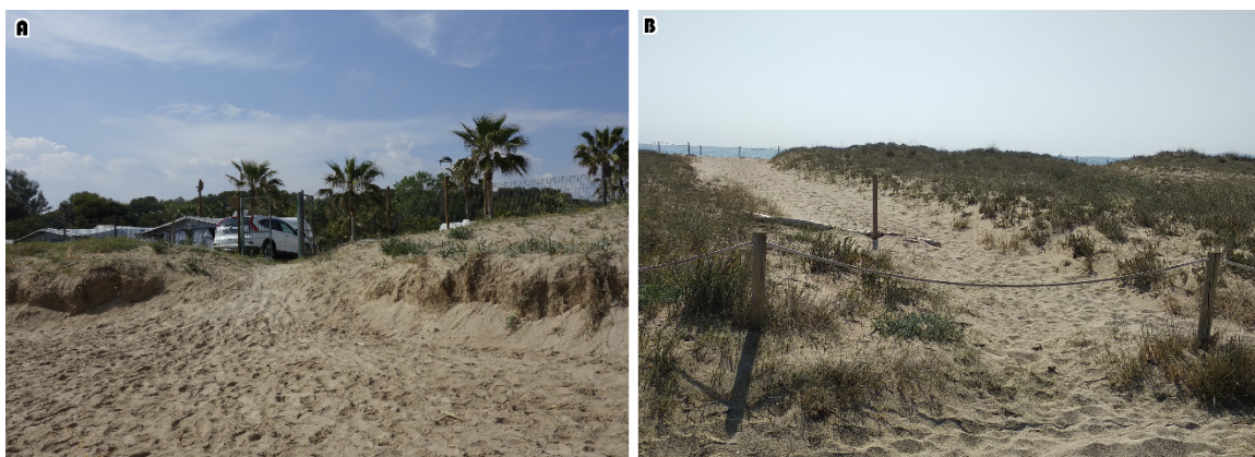
Figure 5. Pathways in Platja Llarga beach in spring 2019 (A) and la Rovina beach in spring 2021 (B). Often, campsites or parkings create unmanaged pathways that erode the foredune; whereas many times roped off dunes are not enough to avoid trampling.

Cluster 1b groups four beaches (Platja Llarga -Fig. 5-, la Rovina, Tavernes and Cabanes). These beaches are featured by the lack of sustainable management focused on the maintenance and recovery of the dune system. The access to the beaches is abundant, both spontaneous and managed. Mechanical cleaning scarps regularly the foredune and difficult the growth of incipient dunes in the upper beach. These pathways are zones vulnerable to erosion, which generates regression of the dune system when storms are of great magnitude. For instance, the Glòria storm caused a large sediment intrusion to reach the interior of the system via its blowouts that are used as unmanaged accesses (Pintó et al. 2020).