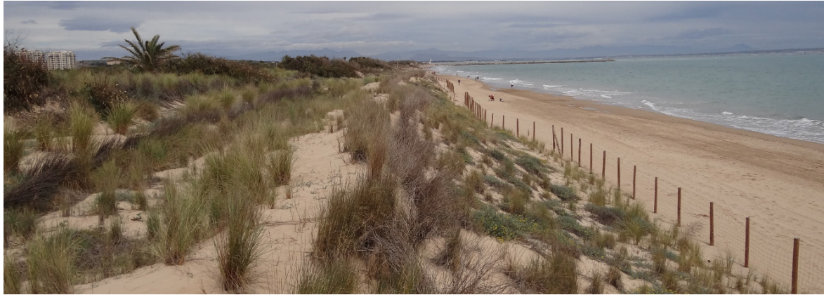
Figure 7. Guardamar beach in summer 2021