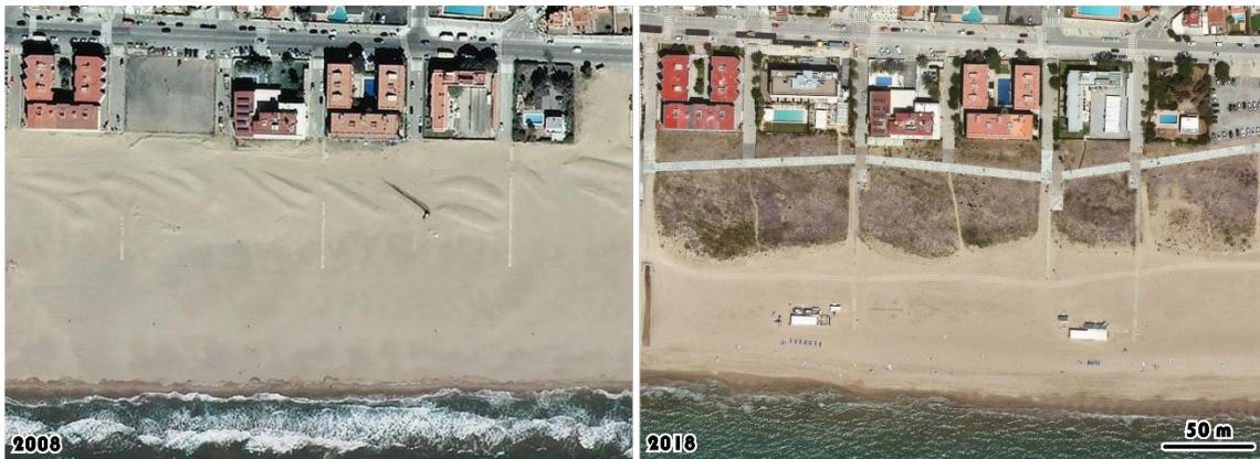
Figure 4. Evolution of Castelldefels beach from 2008 (left) to 2018 (right). In 2008 cords of sand were artificially piled up. In 2018 artificial dune ridges were fully covered by dune vegetation.

Castelldefels beach illustrates this phenomenon well, as dune morphologies are compacted and aeolian dynamics scarcely affect the foredunes (Fig. 3). The high frequentation of people and the usual mechanical cleaning of the dry beach avoid developing embryodunes in the upper beach (Fig. 4: right). From a biogeographic point of view, the revegetation was questioned by Panareda and Pintó (2015) and Pintó et al. (2014b) that carried out an exhaustive study of the vegetal species of the delta and perceive unsatisfactory results in relation to the vegetation and dune morphology. They describe the dune restoration practice of the 90s as a beach sand garden recreation, where aesthetic and recreational criteria prevail over the natural or ecological function of the dune landscape. The dune morphologies that are recovered are integrated into the promenades with gardening criteria rather than considering dunes as natural habitats.