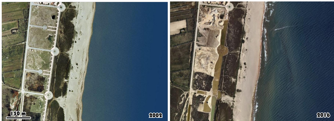
Figure 6. La Pletera beach in 2002 and in 2016.

Cluster 2 includes beaches well conserved from a morphological point of view where sustainable management measures were implemented (la Pletera, els Muntanyans and Guardamar) (Roig-Munar et al. , 2017). As la Pletera beach-dune system (Fig. 6) has been restored using soft management actions such as sand fences, managed paths, eradication of alien species, revegetation of foredune, and roped off dunes (Roig-Munar et al. 2020). Additionally, the deconstruction of the urban area adjacent to the dunes favored the restoration of salt marshes and the recovery of the whole coastal zone. The system evolved toward an erosive state due to the affluence of tourists. The degradation of the foredune morphologies accelerated in a regressive trend until the 2000s, due to the nonapplication of management measures for its recovery. Some sectors of the dune system disappeared and others were composed by isolated incipient dune. In the period 2009–2016 (Fig. 6), the system was subjected to sustainable management measures that allowed slow recovery of the dune system as a whole, migrating toward a state of naturalness. From 2011 onward, the first sustainable management actions were initiated through the use of sand retention fences, revegetation, managed paths, as well as the regulation of facilities on the foredune. During this period, a project of deconstruction of the abandoned area was carried out with the aim of recovering the coastal lagoons and salt marshes.