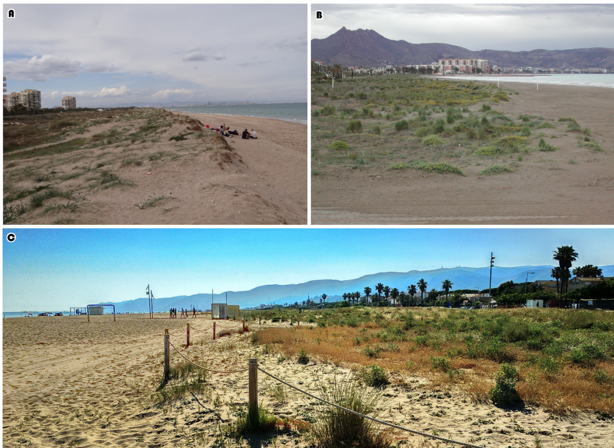
Figure 3. El Saler beach (A) in summer 2021, el Pinar beach in winter 2019 (B) and Castelldefels beach (C) in spring of 2019.

The coastal dunes of the Llobregat delta presented sand erosion, instability of the coast of Viladecans and the N of Gavà, sedimentation in the S Gavà and Castelldefels, the construction of Port Ginesta (1985), vulnerability, loss of surface of dune landforms, high frequentation, soil contamination and proliferation of invasive vegetation (Masip et al. , 2009). From the 90s onward, cords of sand were artificially piled up, simulating dunes that were later revegetated (Fig. 4). Later, under the Dunas Híbridas project (2014 to 2017 according to Palacios, 2017), new dunes were mechanically performed again and reprofiled some others. Afterwards, Ammophila arenaria was used to revegetate dune systems by fences, while invasive vegetation was removed. It is worth highlighting that many individuals of Ammophila arenaria from the Dunas Híbridas project died because of the lack of sand movement on the dune ridges. The artificial sand mounds present a granulometric stratigraphy with different grain sizes throughout the vertical segment. However, the dunes of aeolian origin present an ordered stratigraphic segment, with the coarsest and most compacted grains in the lower part and the finer and looser sand in the upper part. This natural arrangement favors the movement of sand grains located in the upper part of the dunes when soft winds blow. The lack of wind dynamics in artificial dunes favors compaction that, over time, ends up being a sandy plot rather than a dynamic dune area.