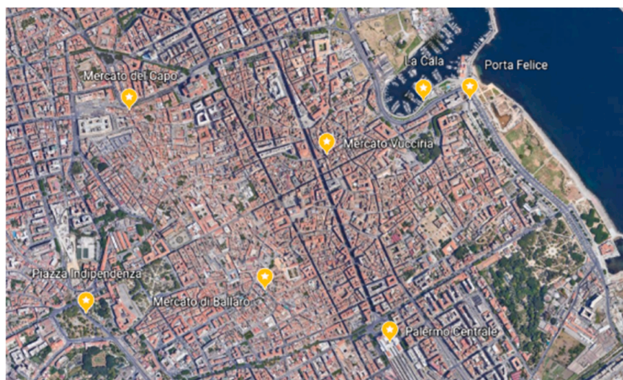
Fig. 1. Map of the street food places (Palermo, Italy).

These foods, as we have seen in the introduction, have ancient origins and are the result of the testimony of the various dominations that have taken place in Sicily. Street food in the city of Palermo is both of vegetable origin (panelle, croccchè) and animal (spleen, stigghioli) and mixed like arancine. Street food is an easy-to-eat food that satisfies the nutritional properties in terms of calories and can be obtained with low spending power. Therefore it is a food that can potentially be purchased by all consumers regardless of low or high spending capacity. It ranges from a minimum of € 1.50 to a maximum of € 2.50 for sandwiches with spleen or panelle and also for the sfinzione (per piece). Even the stigghioli do not have high prices (3–4 euros). Regarding the knowledge of street food, respondents in eight out of ten cases replied that they know