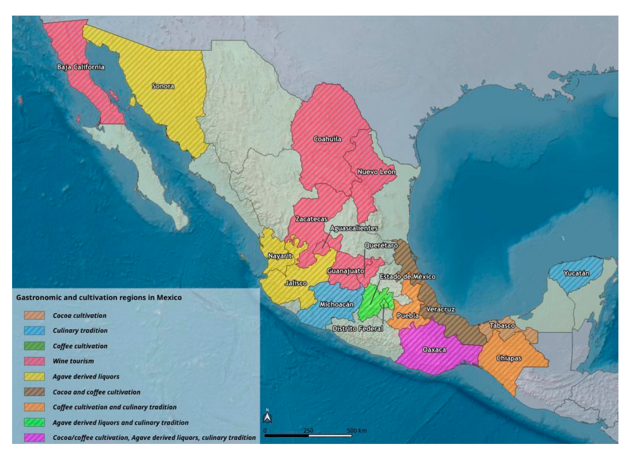
Figure 1. "Local gastronomic regions in Mexico".

Thus, CBT can be seen to foster productive ventures, with the community actively participating in the management of these and the profits being distributed in the local context. As a result of government action or self-managed community initiatives, there are currently 998 companies dedicated to advertising Mexico's alternative tourist services and activities, seven of them with indigenous participation. They are based in 729 locations, within 27 federal entities, and forming part of 414 municipalities, 16.82% of the total 2461 reported by the national municipal department [52].