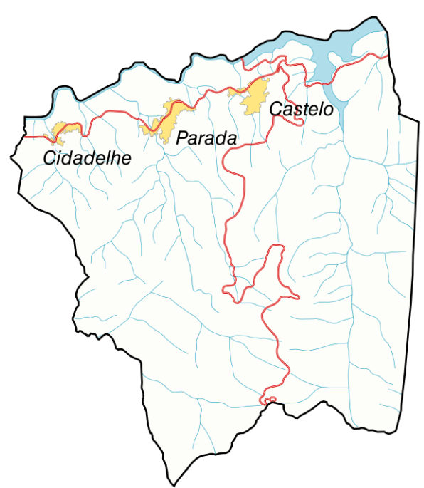
Figure 2. Map of the territory of Lindoso (adapted from Direção-Geral do Território, 2015 by Sérgio Costa)

Lindoso belongs, administratively, to the municipality of Ponte da Barca. In turn, this municipality is part of the NUTS III Alto Minho, which is integrated in the NUTS II North (Fundação Francisco Manuel dos Santos, n.d.). The territory's reduced population is divided into three population nuclei, as can be seen in Figure 2: Lindoso/Real (also denominated Castelo), Parada and Cidadelhe (Fontes, 2011). At a total of 427 inhabitants, Lindoso registers very high ageing indexes and repulsive migratory flows, leading to population decrease in the last decades (Fontes, 2011; Instituto Nacional de Estatística, 2014).