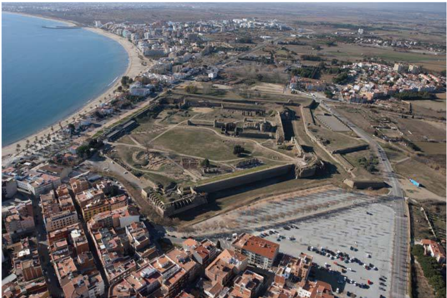
Plate 1. The Citadel in the middle of the town of Roses (2008)

In 1961, the Citadel was recognised in Spanish legislation as a Historical Monument. This did not prevent the demolition of part of the Citadel's walls the same year to make way for an urban development project (La Ciutadella de Roses, 2016). At the same time, various archeological excavations began, and finally the demolition of the walls was halted. However, the site remained closed and abandoned for many years. In 1986, the entire site became a municipal property. It was opened to the public in 1991, and in 1993 a master plan for Roses Citadel was approved, which would establish the bases for its conservation and heritage use. Subsequently, work began to restore areas of the site, under municipal management (La Ciutadella de Roses, 2016). In 2004, a permanent exhibition room was opened, and from 2007 the whole area was named the Citadel Cultural Space. Currently, this space is heavily used. According to a statement made in January 2017 by Carles Páramo,