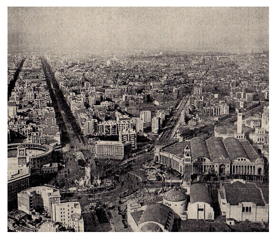
Figure 2. Panoramic view of Barcelona, 1935. Picture published in Barcelona Atracción .

the creation of an idealised account of Barcelona seeks to have an impact abroad, but also at a local level; whilst the image serves to attract foreigners, capital and prestige, and in this way also acts as a mechanism for redefining urban and urbanity. At the beginning of the 20<sup>th</sup> century, this intention was particularly explicit, especially if keeping in mind that the SAF hoped that the presence of tourism in Barcelona would affect and improve that civic character of Barcelona society. It was expected that citizens would participate in the new view of Barcelona; that they would learn to relate themselves with the city in a more elegant and ordered way and that the myth of destination Barcelona would transform the actual city.