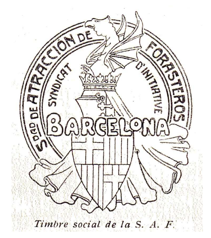
Figure 3. Official seal of the SAF.

already been put into circulation at the end of the 19th century: the message to a modern and European city value, even though romantic and traditional references also reappeared. The image publicised by the SAF was inherently related to the values of progress and the political references of the Catalan conservatism that ruled the city. Although the SAF put in place a multifaceted image of Barcelona of an open and diverse appearance, such an image actually clung to the interests of the potential demands of the tourists that the city aspired to attract: cultured European or American visitors equipped with cultural interests and manners. Monumentality, art, urban planning, shops, culture and the natural landscape are elements that were more highly appreciated by the tourists at the beginning of the 20<sup>th</sup> century. Therefore, following the destination competitor's model, the SAF introduced these references in the tourist imaginary of Barcelona. As demonstrated by Vidal Casellas (2005), the image projected by the SAF centred on four fundamental concepts: contemporary life, art and architecture, commercial life and industrial life. The tourist image that was projected of Barcelona therefore