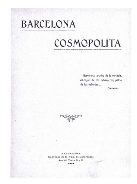
Figure 1. Cover of Barcelona Cosmopolita by Gonçal Arnús, 1908.

be given to the symbolic power of language and image; to its unquestionable influence in the social organisation of reality.