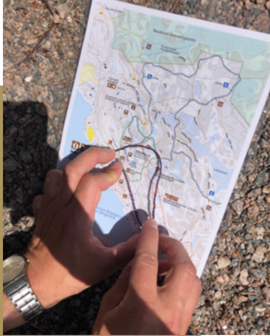
Image 2. Each group chooses the itinerary on the map.