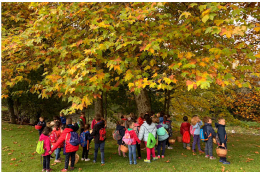
Image 1. Dr. Robert school is committed to outdoor learning from childhood education to grade 6 (all the levels of the school, from childhood to the last course of primary education).

It has a long history working with project-based learning pedagogies related to the school surroundings and community. Since the very first years of its existence, approximately 80 years ago, the school has prioritised establishing links within the environment by getting to know it and integrating outdoor activities in the learning process. One of the main objectives of the school is rooting students into their territory. Thus, Dr. Robert school is committed to including the knowledge of the school surroundings at all levels, not only physical but also social, cultural and historical aspects, in its annual plans. The school collaborates closely with local stakeholders that help teachers to carry out the school transdisciplinary projects.