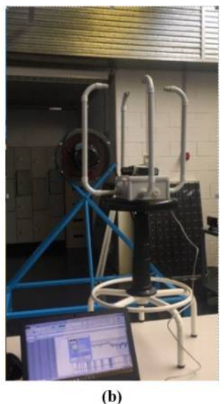
Figure 1. (a) Cup anemometer in situ designed by a fourth-vear undergraduate engineering student at the University of Girona; (b) ultrasonic anemometer ex situ designed by a fourthyear undergraduate engineering student at the University of Girona