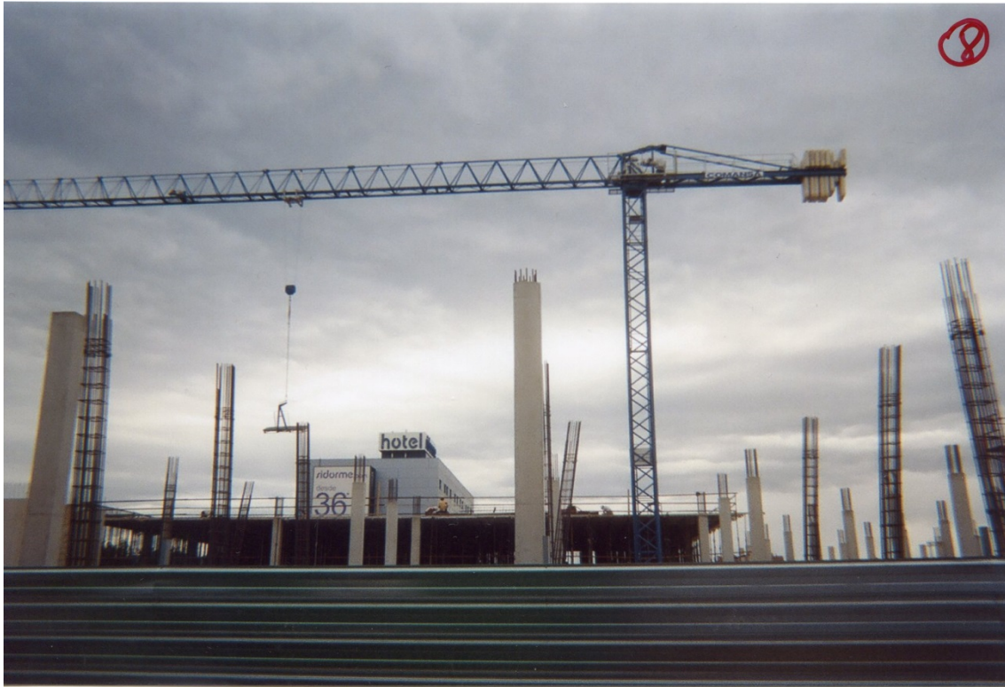
Figure 3: Robert's photograph of an unpleasant space.