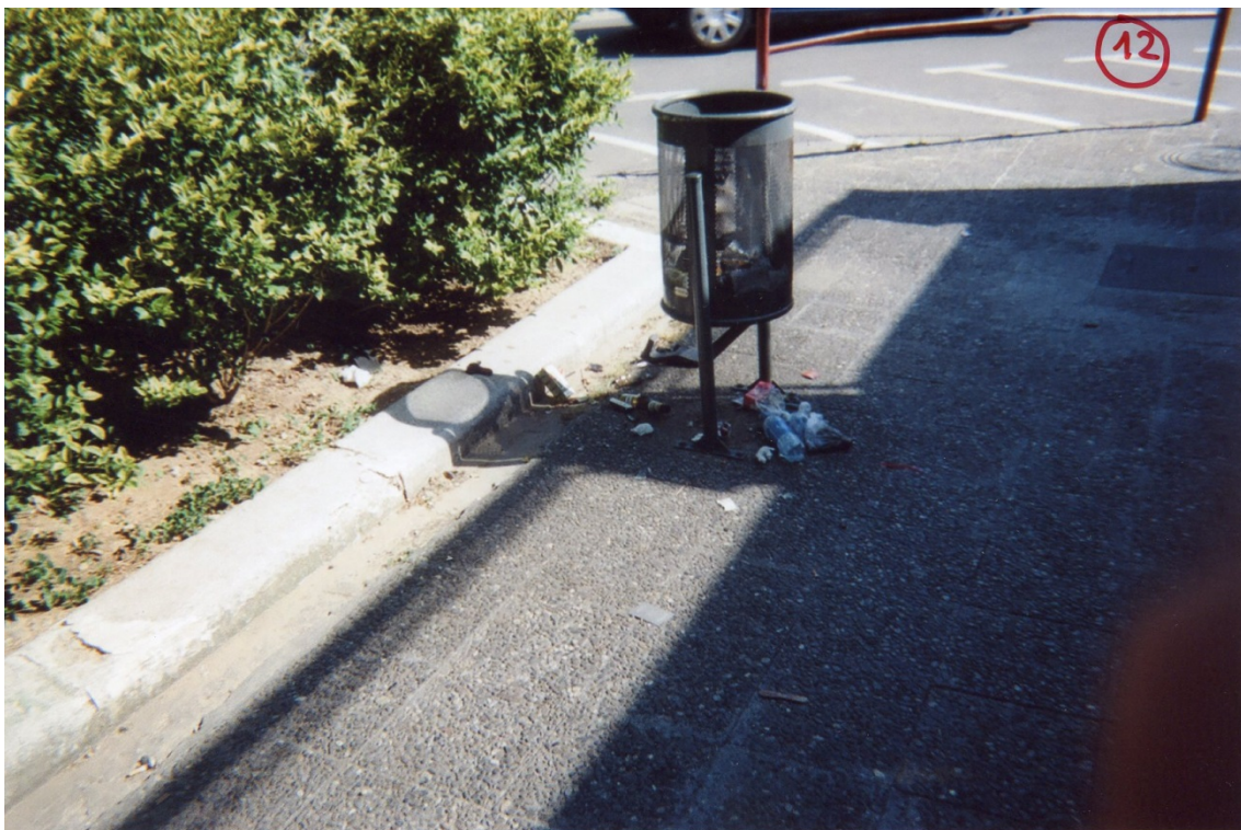
Figure 4. Max's photograph of an object that symbolises an unpleasant feeling