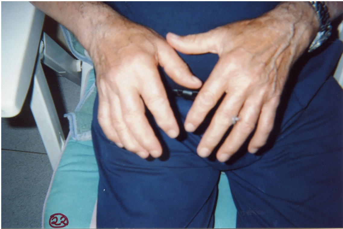
Figure 5: Max's photograph of a significant person in his life