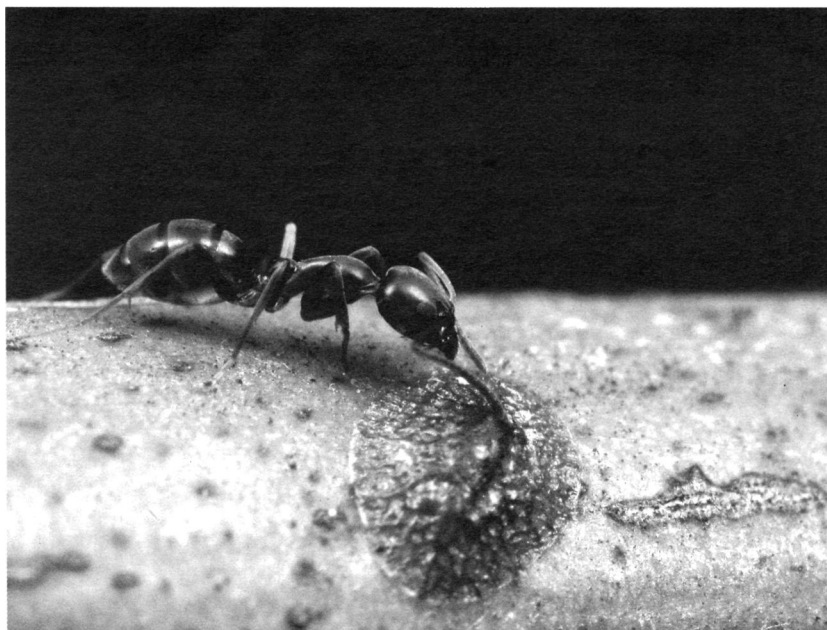
PLATE 1. Argentine ant ( Linepithema humile ) tending scale insects on citrus trees in California, USA.

tolerance to environmental conditions could also affect the extent to which invasive species can invade new environments. The consequences of these changes for the success of Argentine ants in invading new environments remain unknown; clearly, further detailed comparisons between native and introduced populations are necessary.