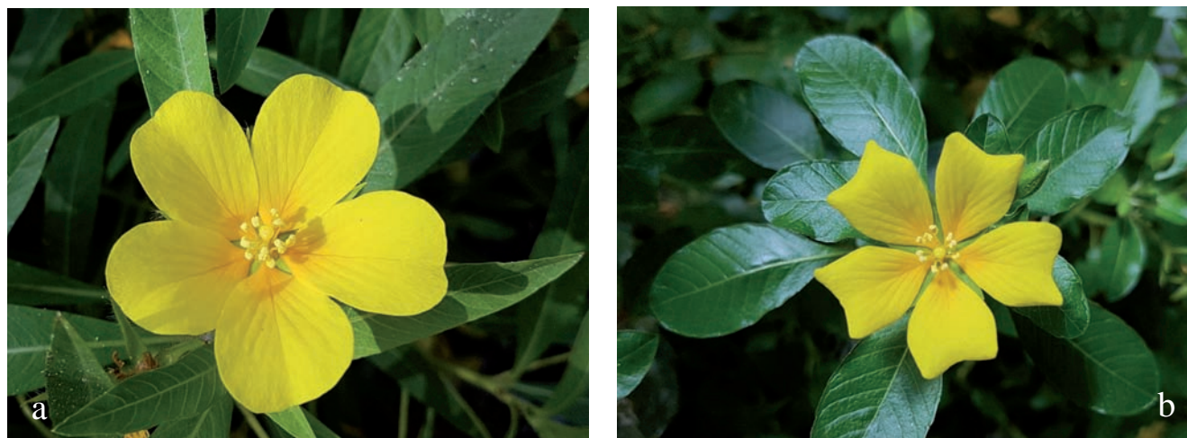
Figure 3. Flowers of a) L. grandiflora subsp. hexapetala from Amposta, and b) L. peploides subsp. montevidensis from Girona.