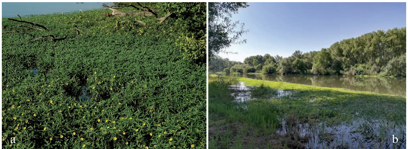
Figure 1. Herbaceous Ludwigia spp. plants in summer 2018: a) L. grandiflora subsp. hexapetala , in the Ebre River, at Amposta; and b) L. peploides subsp. montevidensis , in the Ter River, near Colomers.

was launched to collect samples from the populations of several Catalan basins. In the Ebre River, there was a population (Fig. 1a), not recognised in our previous study, found in the main course of the river, in an area bordering the Ebre Delta Natural Park. An analysis of the morphology of various specimens determined that it was Ludwigia grandiflora subsp. hexapetala (HGI 23947). This taxon naturalised in the Lez River in Montpellier (France) in 1826 (Dandelot, 2004), from where it has expanded its range substantially, becoming one of the invasive aquatic plants with the greatest impact (Ruaux et al. , 2009), with similar biology and dynamics to L. peploides subsp. montevidensis . The presence of L. grandiflora subsp. hexapetala in Catalonia, and specifically in the area of the Ebre Delta, which is geographically more remote from the populations found in France than other basins, raises several doubts about its introduction in Catalonia, the transport vector, and the population it originated from, as it could have come from either European populations or have originated from a native American population.