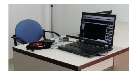
Figure I HEG device. Abbreviation: HEG, hemoencephalography.

Evaluation was made individually for each subject by a single researcher, and always the same researcher, in an isolated and properly conditioned room. The brain activity was recorded at the Fpz electroencephalographic point. At the beginning, a 30-second HEG record was registered to establish the baseline (minimal mental activity). To do this, each subject was asked to close his eyes and visualize the number 1, thus obtaining a homogeneous baseline measurement in all study subjects.